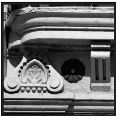
Metal Cornice Detail

The Darke County Courthouse , shows example of Greek inspired columns. Corinthian being the most ornated of the three types can be found on the corners of the courthouse.