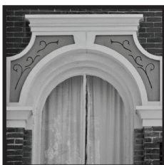
Decorative Window Hood

118 West 5th , A two story Italianate from the early 1880's has been completely refaced with a material to resemble white bricks. This building began as a funeral parlor and was the McWhinney Free Library before Carnegie Library opened in 1903.