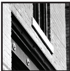
Rosettes & Cast Iron Lintel

114 East 4th , First Presbyterian Church, 1889 Victorian illustrates a round stain glass window with a stone surround. Its main entrance is at the base of the off center square tower. A pointed frontispiece, flanked by cone topped turrets project from the main body of the church.